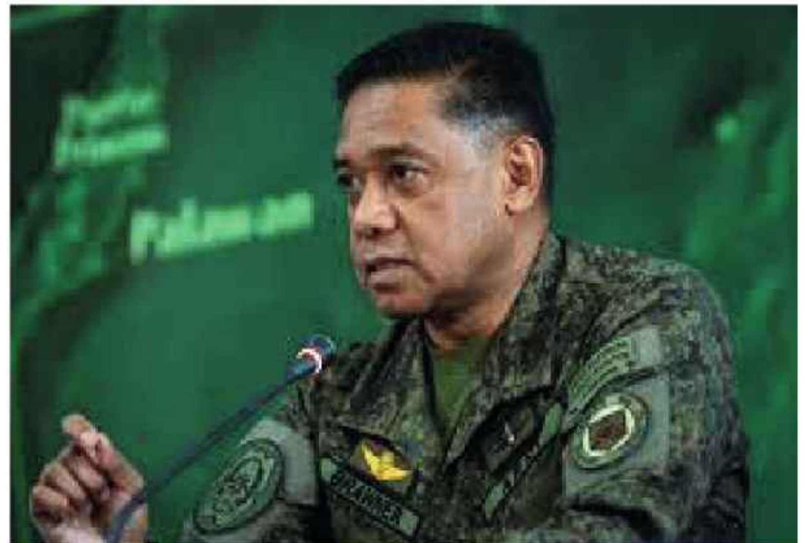
Armed Forces of the Philippines Chief of Staff General Romeo Brawner

Since late 2023, the Philippines have intensified maritime cooperative operations with friendly navies, aimed at asserting navigational rights and countering unilateral claims in contested waters. These have included joint activities with the United States, Japan, Australia, France, and Canada. The inclusion of India in this roster underscores New Delhi's increasing engagement in Indo-Pacific maritime security, and its support for a rules-based regional order.