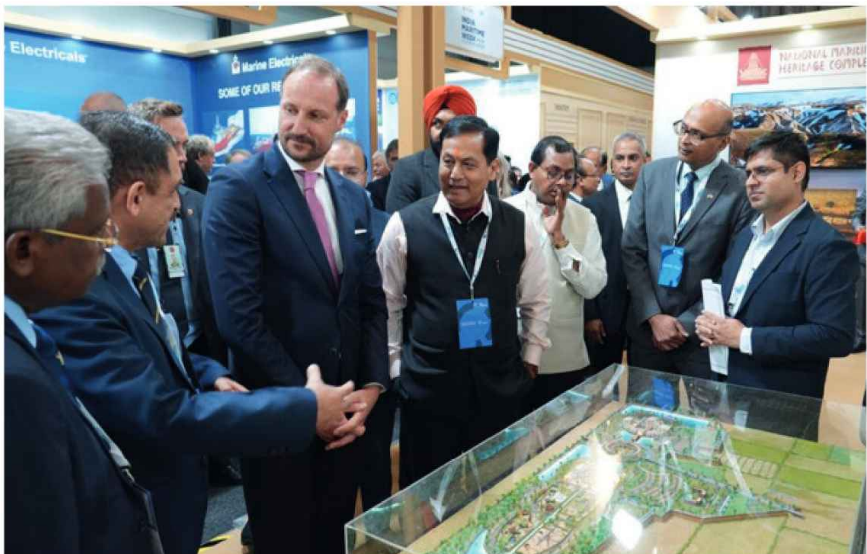
Debt: Maritime Gateway

The highlight of the visit was the signing of a historic Memorandum of Understanding (MoU) between Garden Reach Shipbuilders & Engineers Ltd (GRSE) of India and Norway's Kongsberg Group. This MoU paves the way for the construction of India's first indigenous Polar Research Vessel. The vessel is expected to bolster India's scientific research capabilities in the polar regions and marks a significant stride in 'Make in India' efforts.